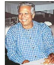
Muhammad Yunus Nobel Peace Prize Winner