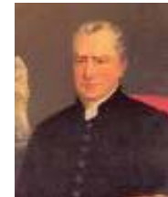
Edmund Rice Historical Social Entrepreneur